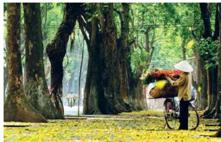
Hanoi Old Quarter