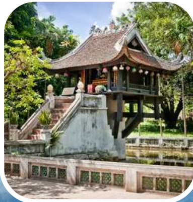
One pillar pagoda