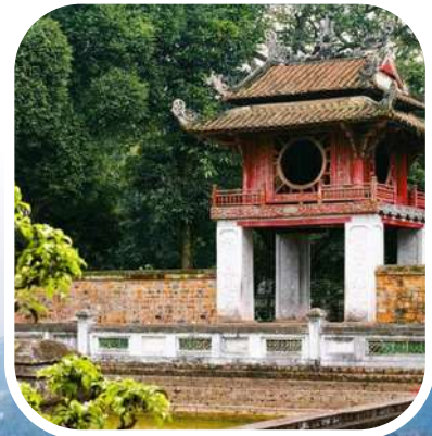
Temple of Literature