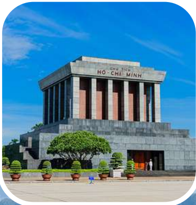
Ho Chi Minh Mausoleum

Note: Please kindly take note that Ho Chi Minh Mausoleum (the inside) will be opened only in the morning. It will be closed every Monday and Friday. Besides the outside of Ho Chi Minh Mausoleum, you can still visit Ba Dinh square, Presidential Palace, Ho Chi Minh's House on stilt, One pillar pagoda as normal