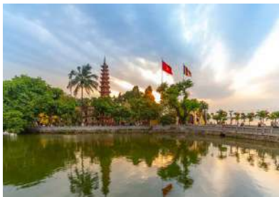
Tran Quoc Pagoda